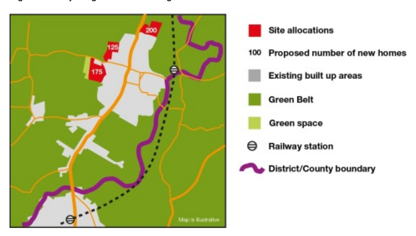
Figure 8.1 Key Diagram for Sawbridgeworth

8.2.1 The main features of the policy approach to development in Sawbridgeworth are shown on Figure 8.1 below: