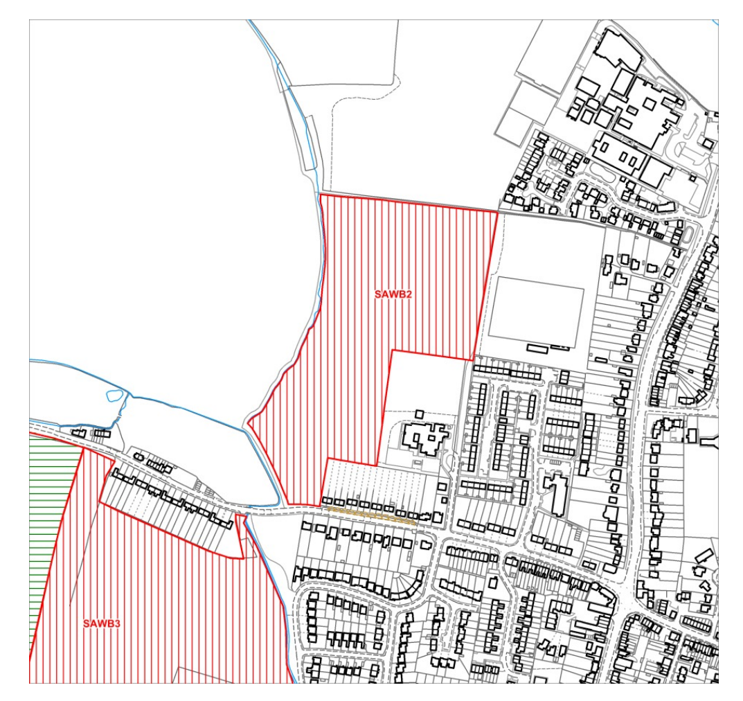
Figure 8.2 Site Location: Land North of West Road

© Crown copyright. All rights reserved. 2015. LA Ref: 100018528.